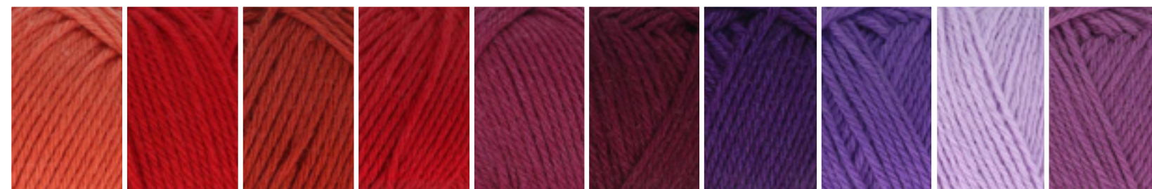
731 Cayenne Red 732 Ruby Red 733 Chestnut 734 Mahogany 742 Rich Plum 741 Deep Grape 738 Rich Berry 737 Deep Lilac 736 Lilac Breeze 740 Purple Dusk