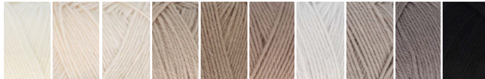
701 Pure White 706 Birch Bark 707 Desert Beige 708 Greige Tan 709 Sandy Taupe 710 Pinecone 702 Petal Peach 703 Sweet Mandarin 704 Slate Grey 705 Midnight