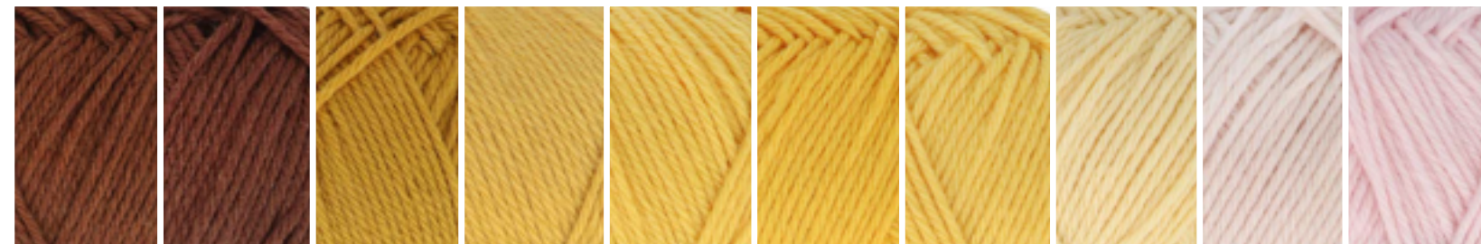
711 Cocoa Husk 712 Coffee Bean 718 Honey Mustard 717 Deep Tumeric 716 Golden Wheat 715 Sunflower 714 Honeycomb 713 Lemon Zest 719 Soft Coral 724 Petal Pink