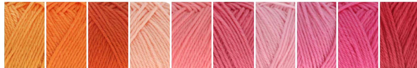
721 Marigold 722 Amber Glow 723 Sunset Blaze 720 Apricot 730 Terra Rose 729 Orchid Pink 725 Rose Quartz 726 Floral Pink 728 Vintage Blush 729 Orchid Pink