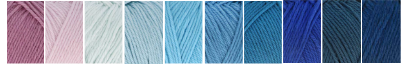
739 Regal Purple 735 Soft Violet 751 Pale Azure 743 Frosty Sky 744 Serene Blue 745 Misty Waters 749 Cosmic Blue 750 Navy Blue 747 Galaxy 748 Deep Sea