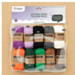
24957 Midnight Feast