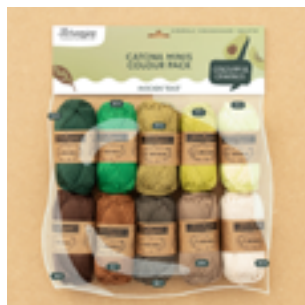
24952 Avocado Toast