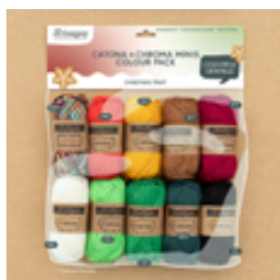
24960 Christm. Treat