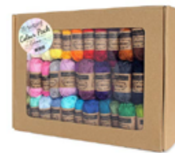
95640 Scheepjes Catona colour pack 109 x 10g

Colour numbers highlighted in teal represent the new Catona shades. The Colour Pack includes 109 shades, indicated in black.