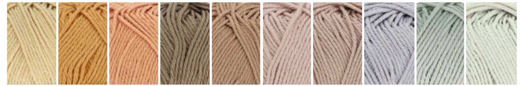
078 Chai Latte 179 Topaz 502 Camel 254 Moon Rock 506 Caramel 257 Antique Mauve 406 Soft Beige 074 Mercury 076 Pebble Green 172 Light Silver