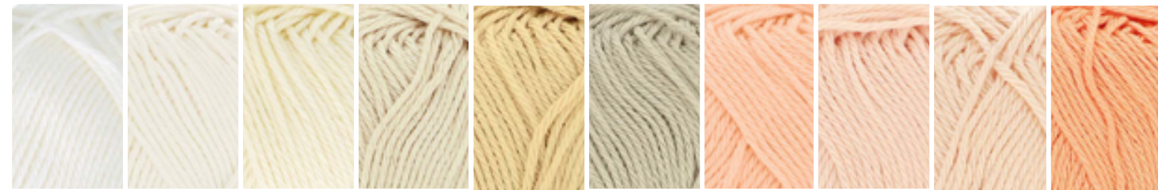
106 Snow White, 105 Bridal White, 130 Old Lace, 505 Linen, 404 English Tea, 248 Champagne, 523 Sweet Mandarin, 263 Petal Peach, 255 Shell, 414 Vintage Peach