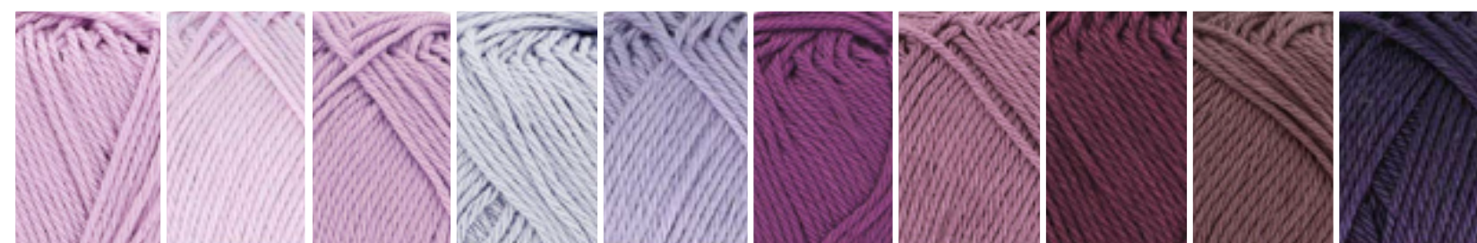
226 Light Orchid, 084 Soft Bloom, 520 Lavendar, 399 Lilac Mist, 086 Wisteria, 282 Ultraviolet, 240 Amethyst, 394 Shadow Purple, 526 Ashes, 085 Fig