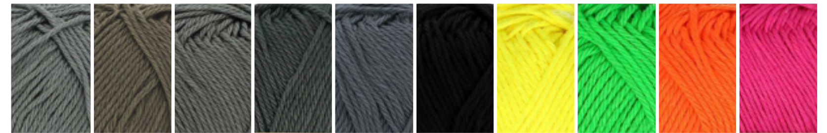
242 Metal Grey 387 Dark Olive 501 Anthracite 075 Storm Cloud 393 Charcoal 110 Jet Black 601 Neon Yellow 602 Neon Green 603 Neon Orange 604 Neon Pink