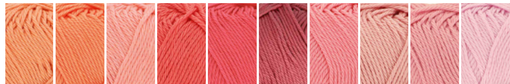
524 Apricot, 410 Rich Coral, 264 Light Coral, 252 Watermelon, 256 Cornelia Rose, 082 Bubblegum, 409 Soft Rose, 408 Old Rose, 518 Marshmallow, 246 Icy Pink