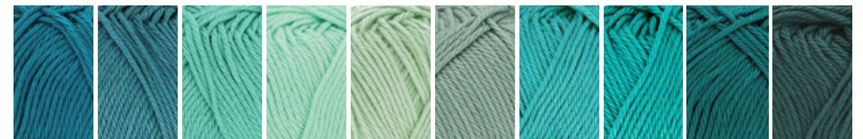
400 Petrol Blue, 089 Lagoon, 253 Tropic, 385 Crystalline, 402 Silver Green, 528 Silver Blue, 090 Teal, 091 Bright Teal, 401 Dark Teal, 244 Spruce