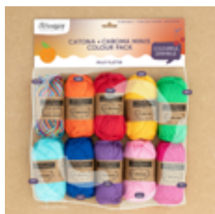
24961 Fruit Platter