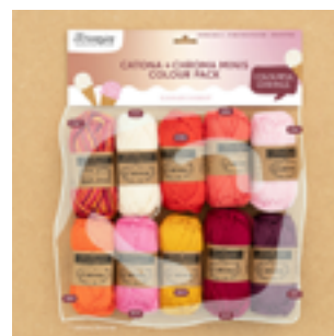
24964 Summer Sherbet