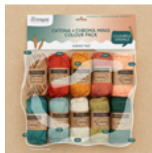
24963 Harvest Tart