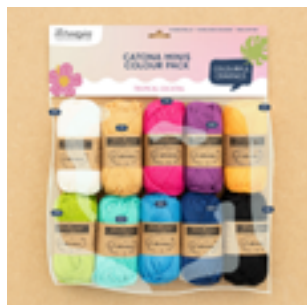
24950 Tropical Cocktail