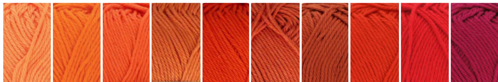
386 Peach 281 Tangarine 189 Royal Orange 080 Marigold 079 Blood Orange 081 Clay Red 388 Rust 390 Poppy Rose 115 Hot Red 192 Scarlet