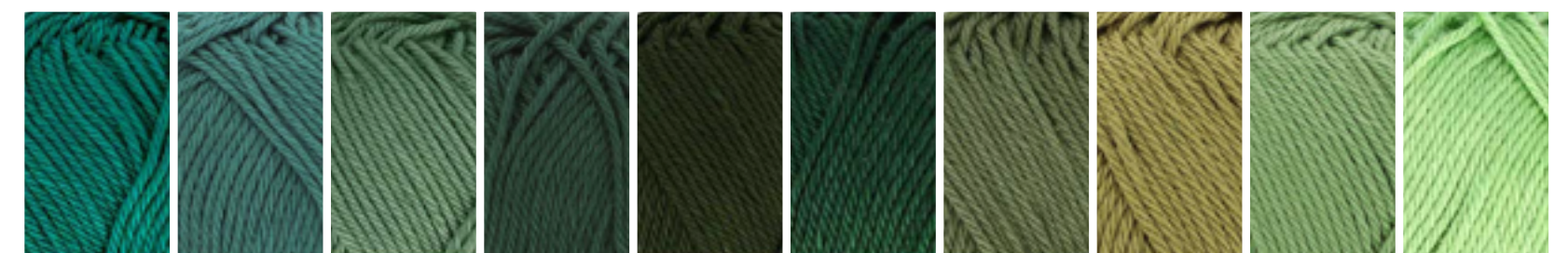
094 Vintage Teal, 391 Deep Ocean, 102 Eucalyptus, 525 Fir, 096 Seaweed, 095 Ivy, 097 Cactus, 395 Willow, 212 Sage Green, 103 Sprout