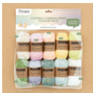
24962 Marshmallow Mix