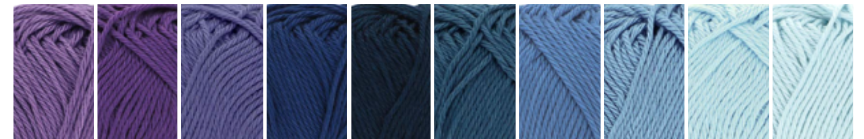
113 Delphinium, 521 Deep Violet, 508 Deep Amethyst, 527 Midnight, 124 Ultramarine, 164 Light Navy, 261 Capri Blue, 247 Bluebird, 173 Bluebell, 509 Baby Blue