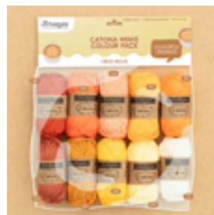
24958 Crème Brûlée