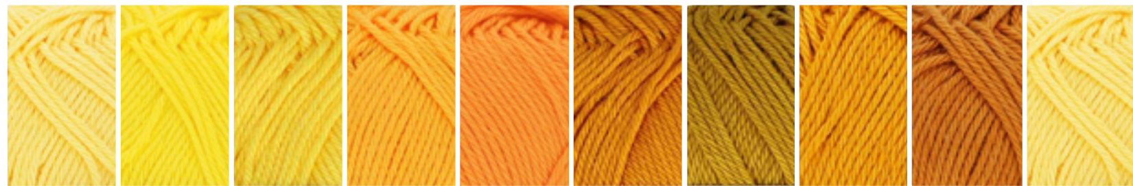
522 Primrose 280 Lemon 077 Goldenrod 208 Yellow Gold 411 Sweet Orange 119 Golden Hour 118 Golden Wheat 249 Saffron 383 Ginger Gold 112 Fudge