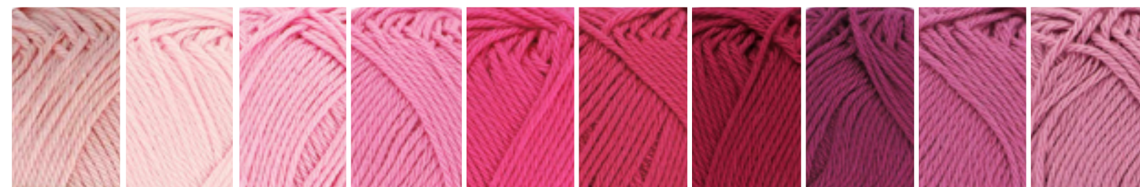
083 Ballet Pink, 238 Powder Pink, 222 Tulip, 519 Freesia, 114 Shocking Pink, 413 Cherry, 517 Ruby, 128 Tyrian Purple, 251 Garden Rose, 398 Colonial Rose