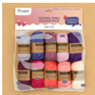
24955 Berry Bliss