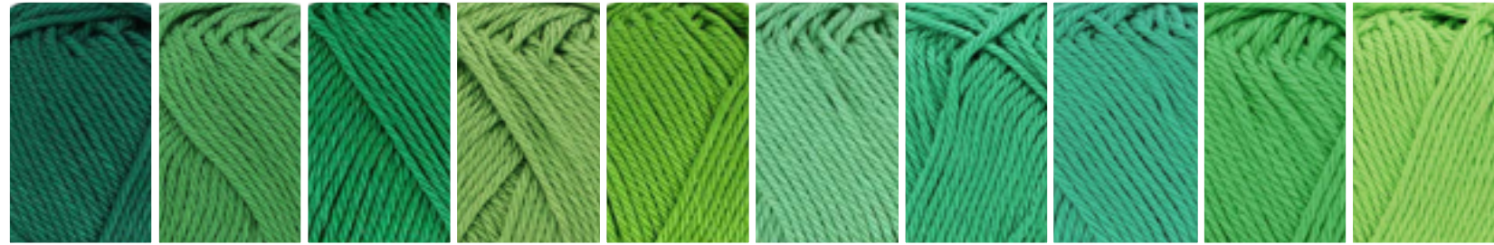
098 Bottle Green 515 Emerald 099 Pine 412 Forest Green 117 Basil 108 Lemon Grass 241 Parrot Green 514 Jade 389 Apple Green 513 Apple Granny