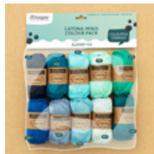
24953 Blueberry Fizz