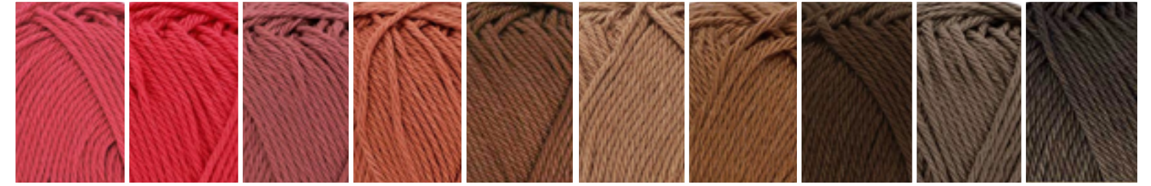
258 Rosewood 516 Candy Apple 396 Rose Wine 504 Brick red 109 Cocoa Pod 503 Hazelnut 157 Root Beer 162 Black Coffee 507 Chocolate 111 Cocoa Bean