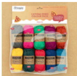
24956 Pizza Pie