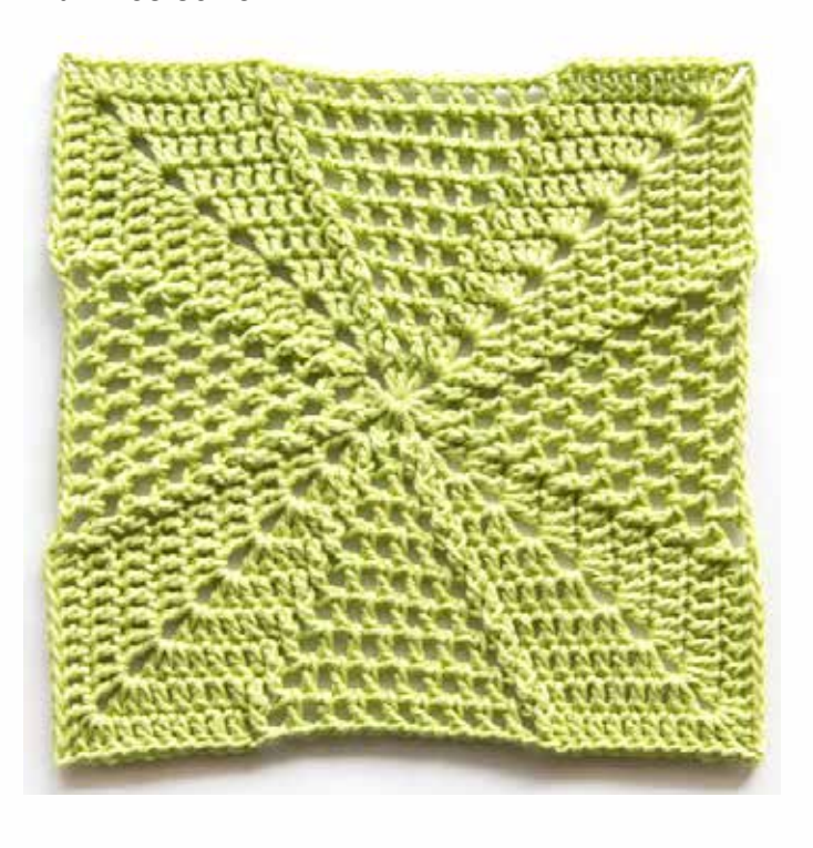
Kit 2 - colour 726