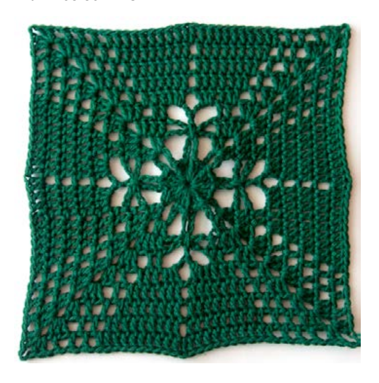
Kit 2 - colour 510